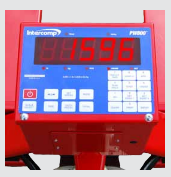
Easy-to-Use, push-button indicator offers Zero, Tare, Net/Gross, Unit (lb/kg Conversion), Total Weight, Peak Hold & Set Points at the touch of a button!