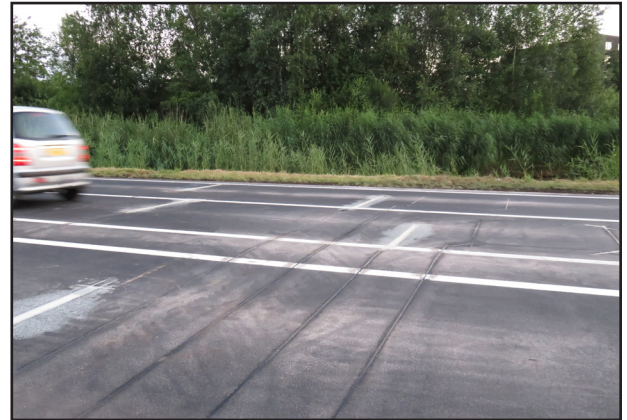
Intercomp sensors installed in staggered pairs in each traffic lane.