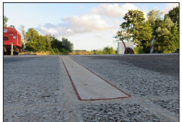
Intercomp strip sensors are grouted in place and ground flush with the pavement.