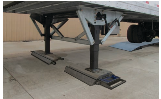
PT300DW™ Filling Scale slides under the front 'landing gear' supports of any semi-trailer.