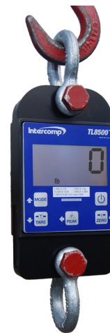
A large, backlit, LCD display and long battery life make the TL8500™ Tension Link a top choice for many different applications and industries.