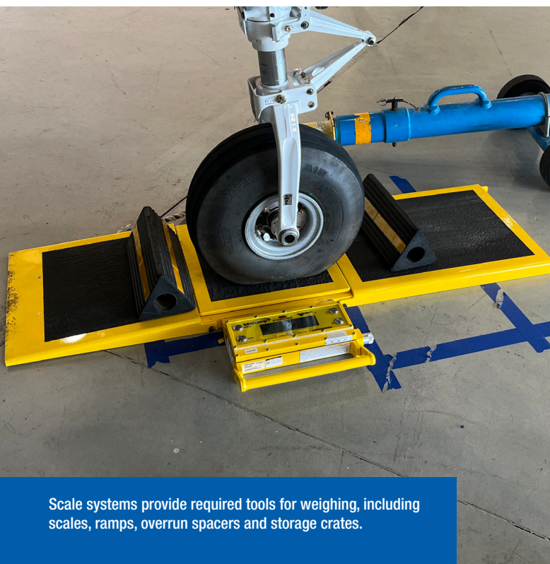
Scale systems provide required tools for weighing, including scales, ramps, overrun spacers and storage crates.

“Units can now weigh a U-28A in a fraction of the time versus older, manual methods. Low-profile scales with wireless communication direct to AWBS software save manpower and minimize record-keeping.” - Patrick McIntyre, Director of Weight and Balance Training, Intercomp Company