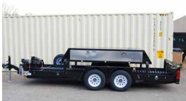
The AX900™ Axle Scale Trailer is a reliable and durable option for transporting AX900™ scales to areas not served by permanent truck scales.

The Texas Department of Safety has stated that the trailer allows for the easy loading and unloading of the scale system at locations decided by enforcement officers. The department has been able to increase the efficiency, safety and transportation of their AX900™ Axle scales with the AX900™ Trailer. The trailer has helped them tackle the daily challenges of Commercial Vehicle Enforcement in a variety of environments and locations. Intercomp continues to work on new innovations to better serve their customers.