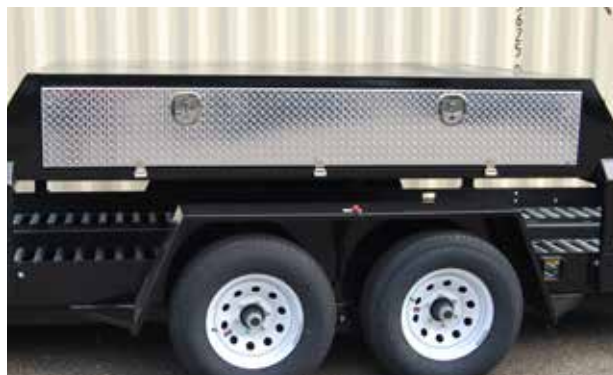
Toolboxes and overhead storage provide additional space for associated equipment, signage, and other needs of the enforcement officers.