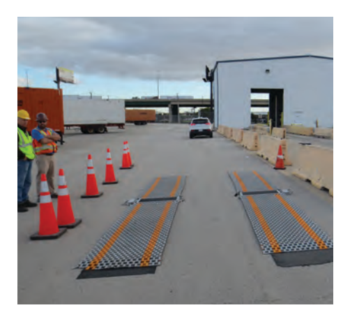
The rail carrier used Intercomp's LS630-WIM™ portable scale to evaluate the benefits of integrating Weigh-In-Motion technology into their new automated gates.

"Accurately identifying the weight of a unit as it enters the facility enables load planners to avoid the delays, inefficiencies and accidents caused by under- and over-weight containers."