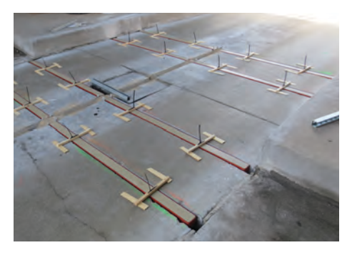
Pairs of Intercomp's WIM sensors were easily and quickly installed with little disruption to the terminal's operations