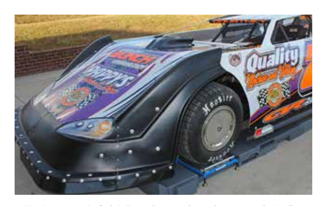
Use Intercomp's Quick Rack for a variety of racecars, including those for road, oval and drag racing.