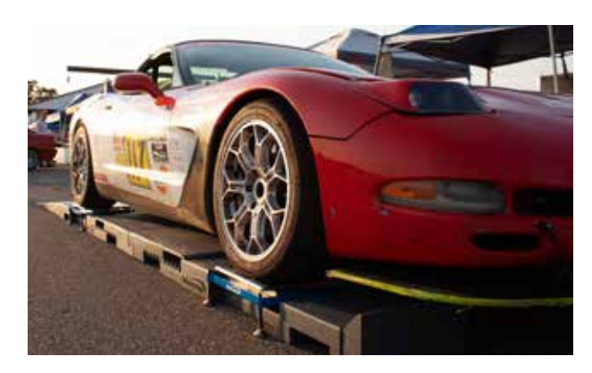
The modular design of the Quik Rack allows for fast initial setup and easy adjustment for differently-sized vehicles.