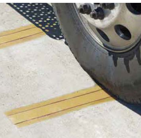
Strain Gauge-based Strip Sensors offer improved accuracies for Gross Vehicle Weights and Axle Weights versus piezoelectric sensors.