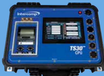
TS30™ WIM CPU

Provides the ability to process weight-related data and is self-enclosed with a thermal printer in a rugged, all-weather case for use in even the most remote locations. Collect and totalize axle weight, gross weight, vehicle ID & class for reporting and data collection.