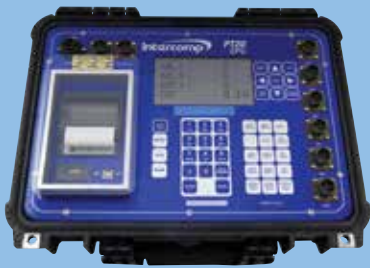
PT20™ WIM CPU

Provides the ability to process weight-related data and is self-enclosed with a thermal printer in a rugged, all-weather case for use in even the most remote locations. Collect and totalize axle weight, gross weight, vehicle ID & class for reporting and data collection.