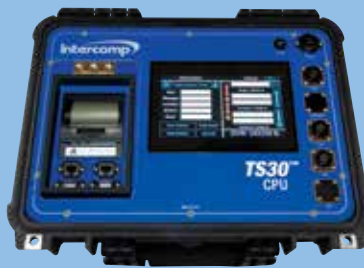
TS30™ WIM CPU

Provides the ability to process weight-related data and is self-enclosed with a thermal printer in a rugged, all-weather case for use in even the most remote locations. Collect and totalize axle weight, gross weight, vehicle ID & class for reporting and data collection.