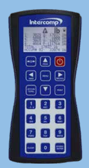
HH400™ (IWH) RFX® Indicator (Optional Accessory)

RS232 Serial Output & Direct Power Connector External Battery Charger Rechargeable Batteries Direct Power Cable (100-250VAC Supply) Serial Output Cable, RS232/USB HH400™ (IWH) RFX® Indicator Thermal Printer