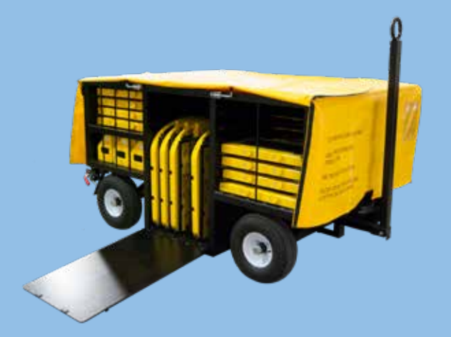
Low-Profile, Towable Cart Eliminates Lifting of Scales & Contains Entire Kit – Including Ramps, Spacers, Tire Stops & Scales

Fly-by-wire technology—as with modern aircraft systems, the AC60-LP <sup>™</sup> contains no hydraulic/piezo pressure sensing. The shear beam load cells are scale industry standard for high capacity platform weighing and unsurpassed in their ability to mitigate the effects of side load caused by long moments or rotational forces and eliminate the need for leveling when weighing on sloped hangar floors. Scale readings stabilize in seconds, providing excellent repeatability and return to zero. The fully-electronic design eliminates the need for warm up, and can automatically adjust for changes in temperature to provide consistent readings no matter the climatic conditions.