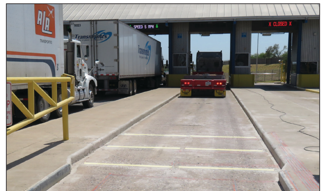
Three rows of sensors meet performance requirements while minimizing maintenance.