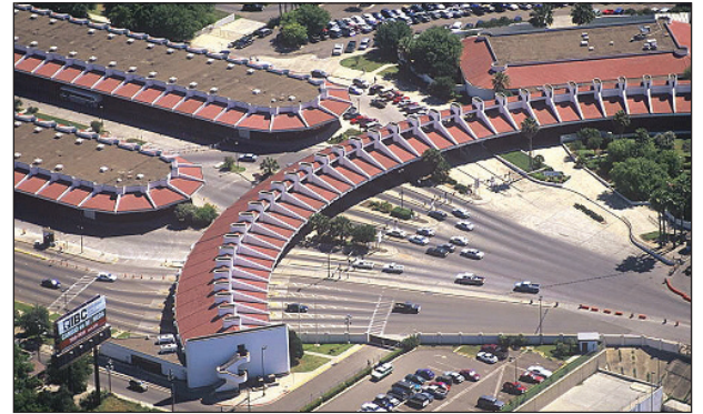
The Port of Laredo is the busiest truck crossing on the US-Mexico border.

When compared to older technology, the integrated Intercomp WIM strip sensors embedded in each lane provide greater accuracy while reducing existing maintenance costs. With a high traffic load at the border, the Intercomp strip sensors allow automation of weight-based transactions, which will be vital to meet the steady growth in traffic expected at the border crossing over the next decade.