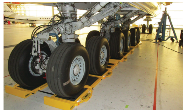
Scales, along with custom spacers, for a unique main gear configuration.