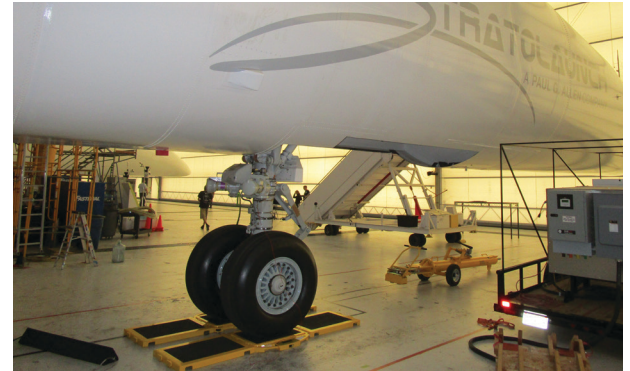
Low Profile AC60-LP™ scales are capable of weighing a wide range of aircraft, including the Stratolaunch.

For more information about Scaled Composites: https://www.scaled.com/